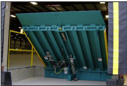
Industry leading 10" above dock and 8" below dock service range.