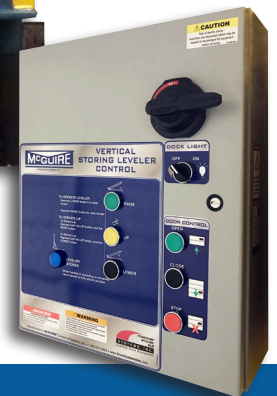
* VSH7640 shown with optional integrated controls.