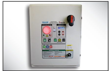
Optional iDock® Controls offer enhanced operation and an interactive message display with equipment information.

The McGuire (VSH) Vertical Storing Hydraulic Leveler offers unmatched environmental control for temperature sensitive applications. Designed with the highest level of strength, security and safety make the VSH an excellent choice for any advanced loading dock operation.